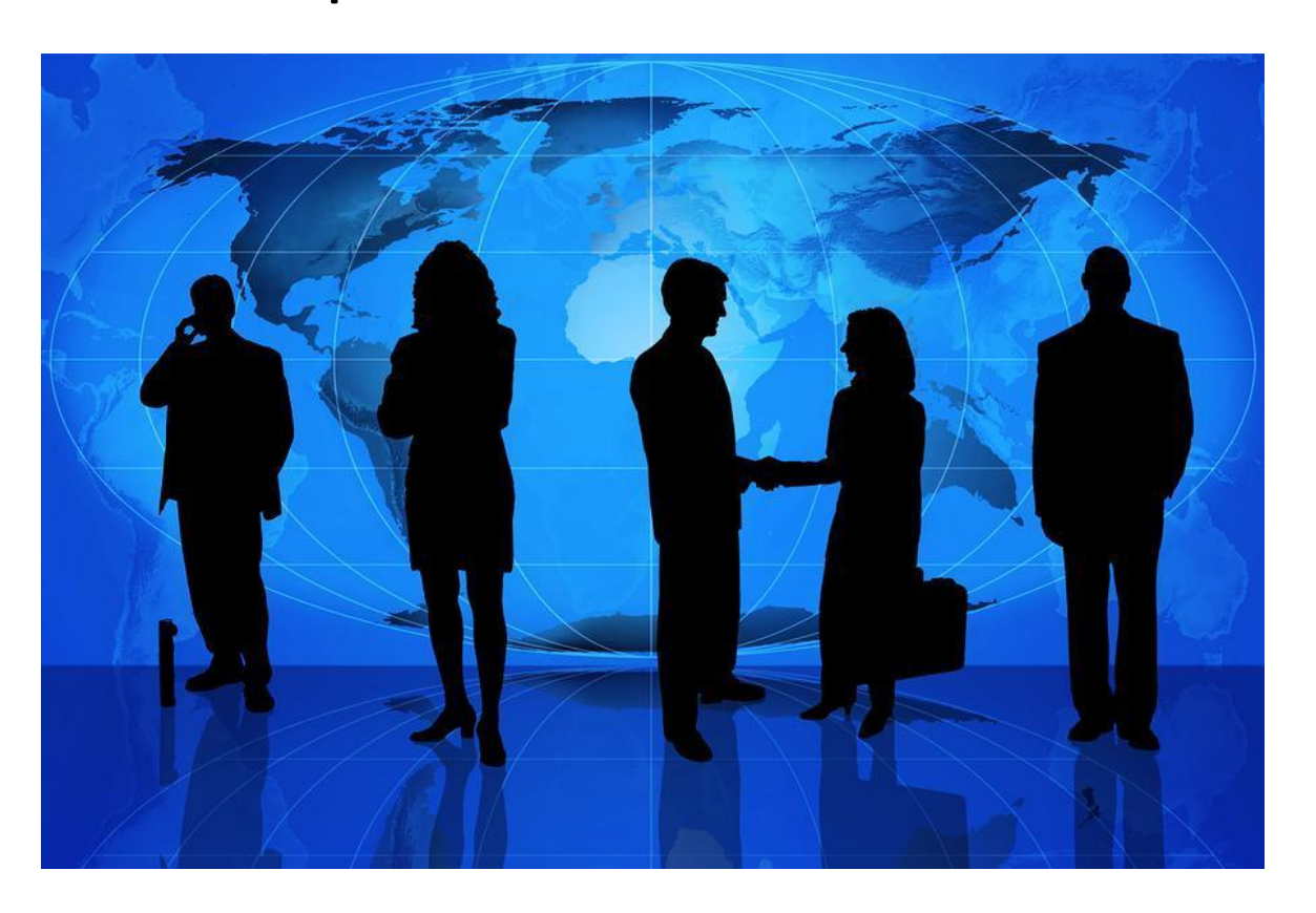
BFU: Capitalism and Investment